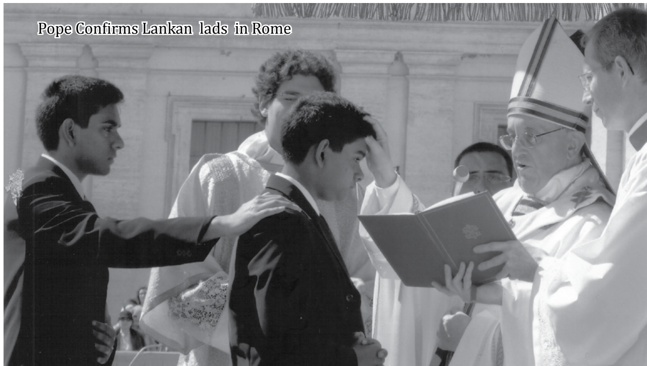
Pope Confirms Lankan lads in Rome