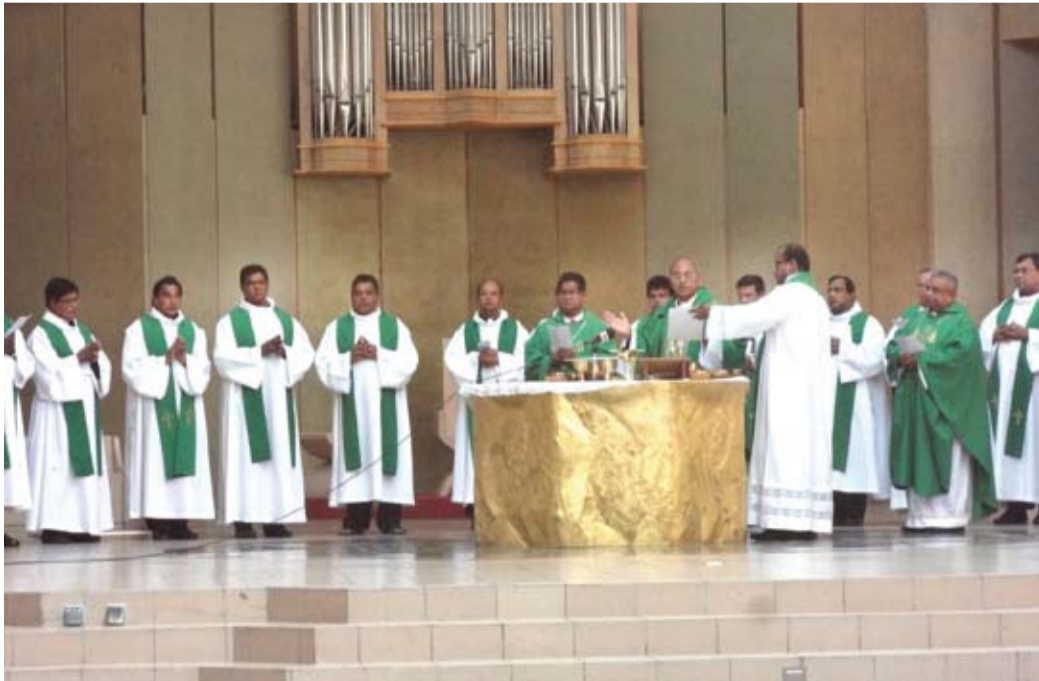
Inaugural Holy Mass