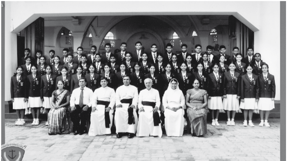
Prefect's Investiture 2014

The Prefects' Investiture of St. Jude's College, Kurana, Negombo was held recently.