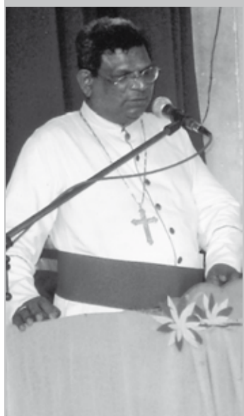
Bishop of Ratnapura