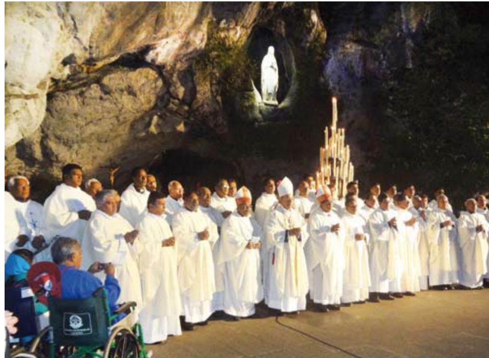
Dedication of the Archdiocese of Colombo to our Blessed at the Grotto of Our Lady of Lourdes